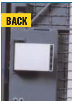
(CB-2) Push Paddle... hand-sized paddle for quick exit. Match with key or five-digit push button lock.