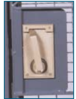
(SB-4) Lever Handle ...alternative to standard door knob. Meets ADA requirements.