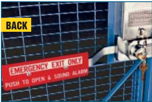
(CB-4) Alarm Lock... sounds battery powered alarm when opened. Available with or without exterior key access.