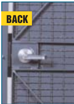
(CB-1) Master Lock® ADA Handle... meets ADA requirements, available with or without key. (Twist button lock shown)