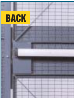
(CB-3) Push Bar... push bar runs full width of door. Match with key or five-digit push button lock.