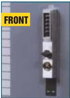
(CF-2) Five-Button Coded Access Lock ...allows code or key entry. Match with push paddle or thumb turn knob inside.