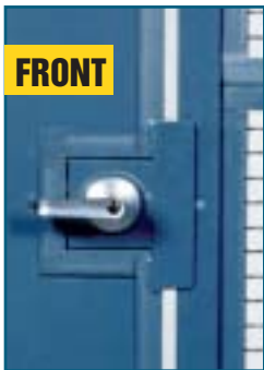
(CF-1) Master Lock® ADA Handle... meets ADA requirements, available with or without key lock. (Key Lock shown)