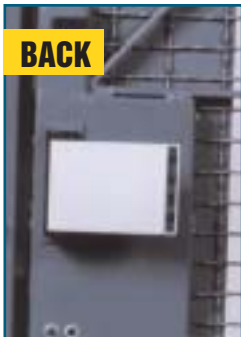
(CB-2) Push Paddle... hand-sized paddle for quick exit.