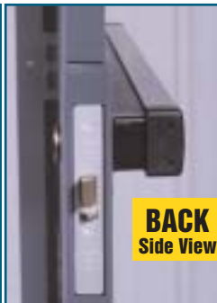
BACK Side View