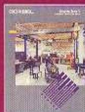
Seismic Zone IV